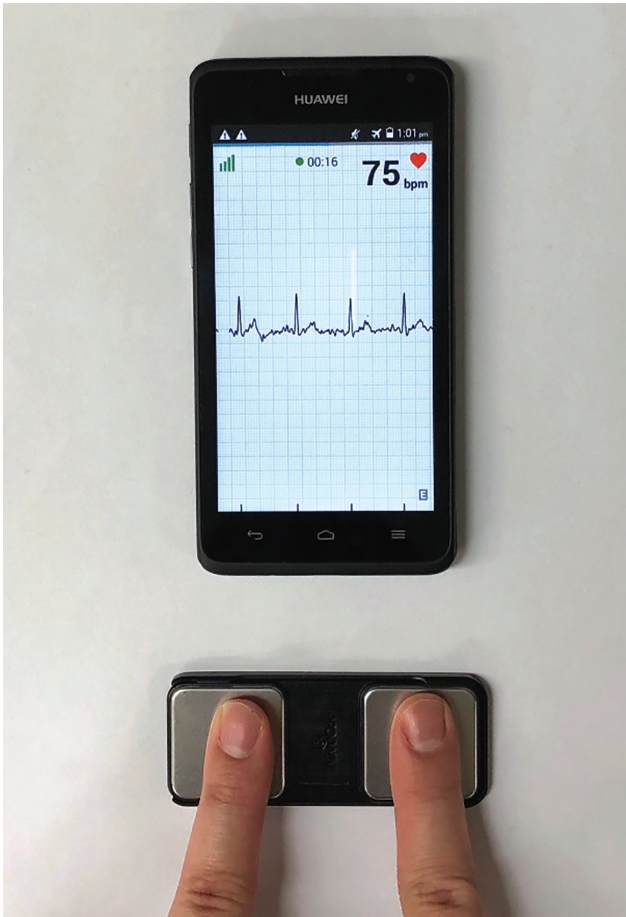
Figure 1. AliveCor Kardia mobile electrocardiogram (ECG) device, showing index finger of right and left hand touching the respective electrode. Recorded ECG rhythm strip shows sinus rhythm.